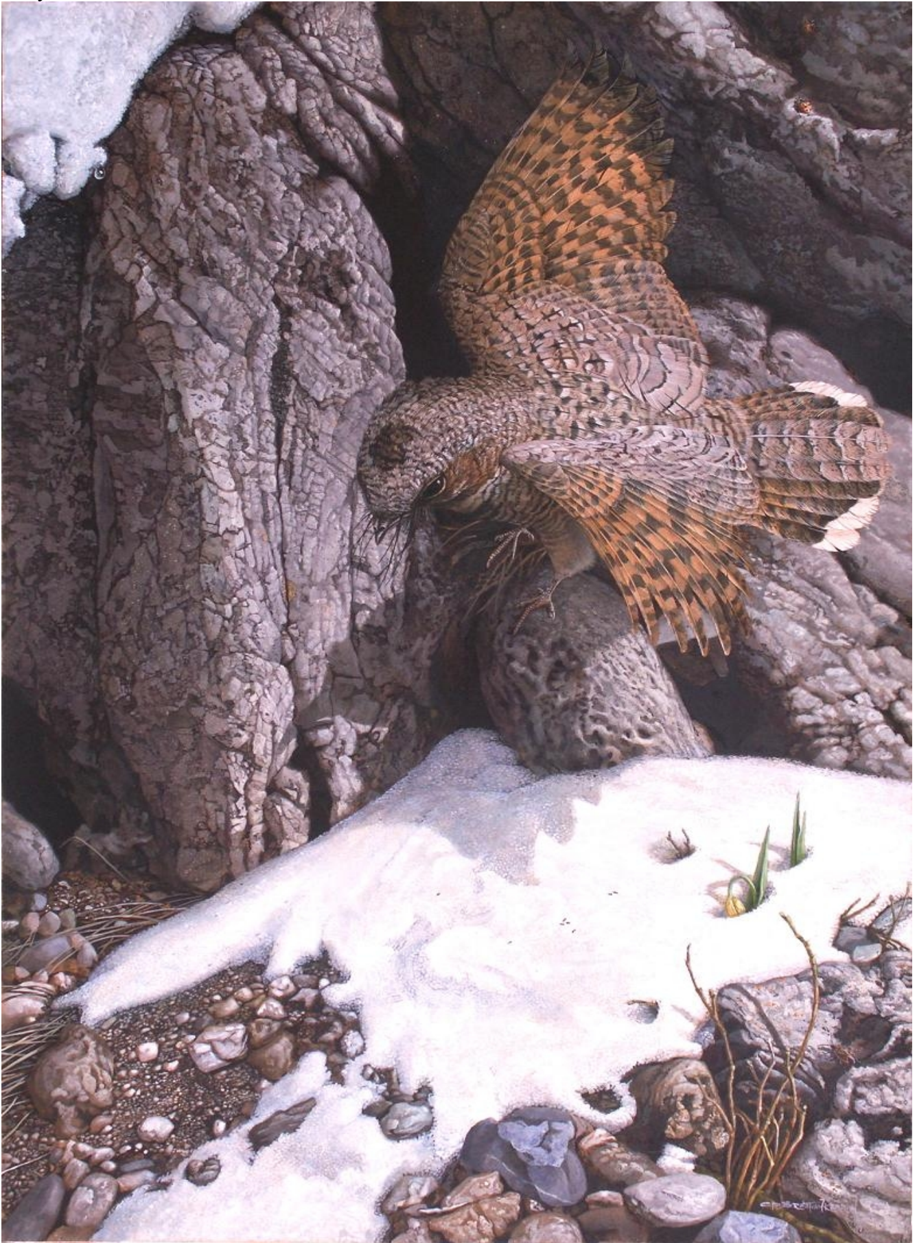
8. REANIMATION—COMMON POORWILL (2012) acrylic on illustration board 30" x 20"